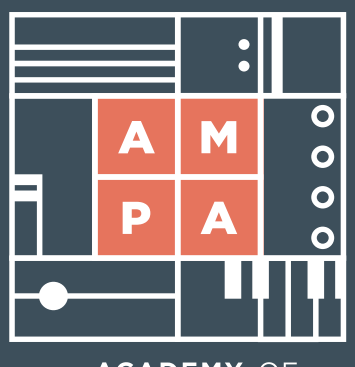
ACADEMY OF MUSIC AND PERFORMING ARTS